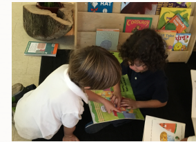
Reading the pictures

Children are developing literacy and math understandings during their play.