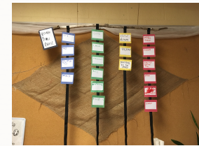
Zones of Regulation

Children are thinking about their feelings, their bodies, and their brains.