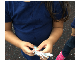
"a feather is like a straw..."

Children are using their curiosity to ask questions, experiment, and problem solve during their explorations.